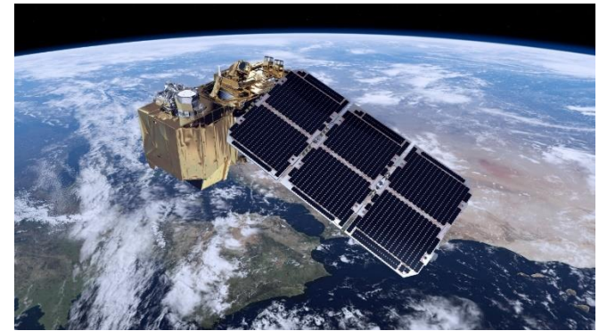
Figure 3: Artist's illustration of one of the two Sentinel-2 satellites whose imagery is used to estimate forest biomass.

Ecosystem modeling for forestry biomass and soil organic carbon: Many actors supporting or implementing nature-based carbon projects rely on comprehensive process-based and/or empirical modeling and machine learning approaches to obtain estimates of above and/or below-ground carbon stocks. Models are supported by empirical data for calibration, validation, and as an input. Both open/peer-reviewed and proprietary models are employed, depending on actor and application. Comprehensive data platforms aggregate a broad range of data from various sources, including field measurements, satellite imagery, LiDAR, and weather data. One area of focus is on high levels of data coverage and consistency (notably time series). Some actors incorporate and scale client-provided process-based models on their data processing platforms. Existing data streams from other actors are integrated (for example from farm management systems in the case of soil organic carbon). Models rely on large numbers of variables. According to the interviewed actors, in some cases this inhibits their application without dedicated support from domain experts. Products are therefore often offered as software as a service (SAAS).