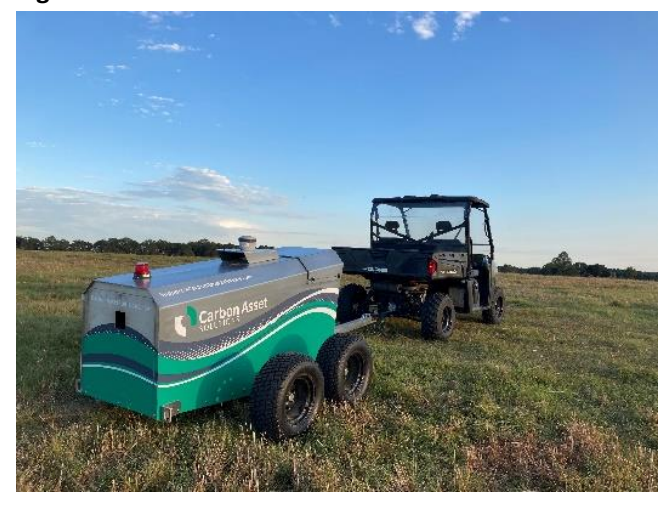
Figure 4: Device for in-situ measurement of soil carbon based on inelastic neutron scattering.

30 cm topsoil layer is measured at once. Built as a compact integrated and mobile device, the measurement apparatus is promised to be flexibly deployable in the field and moved easily, thus enabling high coverage while being pulled across a field. The device measures total soil carbon levels. Inorganic carbon is assumed to represent a constant background in the context of carbon accumulation. Concerning measurement accuracy, the solution is advertised as a viable alternative to laboratory-based analyses. Commercial rollout is scheduled for the near future. The resulting data is stored on a distributed ledger database.