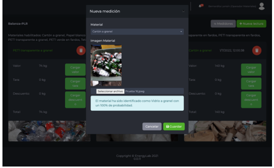
Figure E. Artificial intelligence module for materials type recognition.