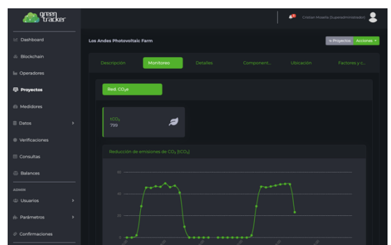
Figure C. IoT monitoring for emission reductions profile for a PV power plant.